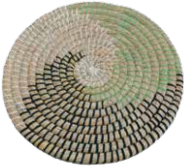
HTM009 Placemat Kaisa, GRS Certified Yarn Handmade