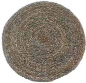
HTM007 Placemat Seagrass Sewing