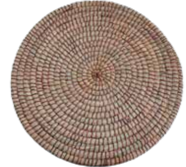
HTM019 Placemat Kaisa, GRS Certified Yarn Handmade