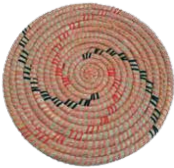
HTM012 Placemat Kaisa, GRS Certified Yarn Handmade