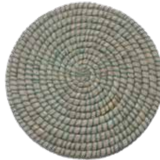
HTM016 Placemat Kaisa, GRS Certified Yarn Handmade