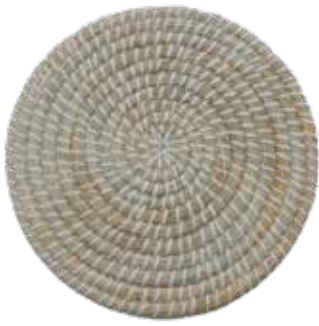
HTM015 Placemat Kaisa, GRS Certified Yarn Handmade