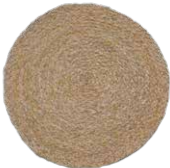
HTM008 Placemat Seagrass Sewing