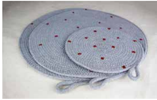
HTM017 Placemat GRS Drawstring Sewing