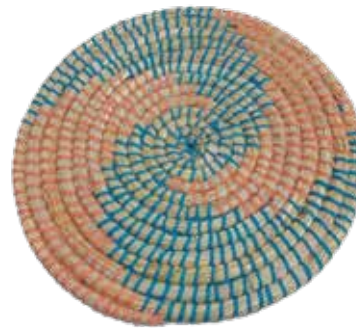
HTM010 Placemat Kaisa, GRS Certified Yarn Handmade