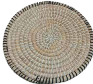
HTM013 Placemat Kaisa, GRS Certified Yarn Handmade