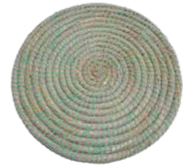
HTM011 Placemat Kaisa, GRS Certified Yarn Handmade