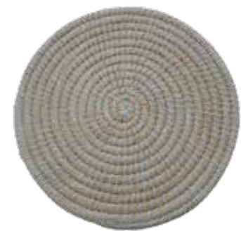
HTM014 Placemat Kaisa, GRS Certified Yarn Handmade