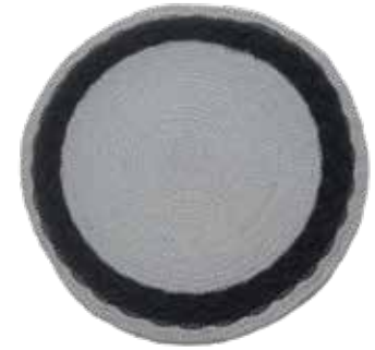
HTM018 Placemat GRS Drawstring Sewing