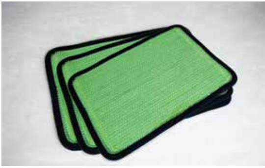
HTM006 Placemat GRS Drawstring Sewing